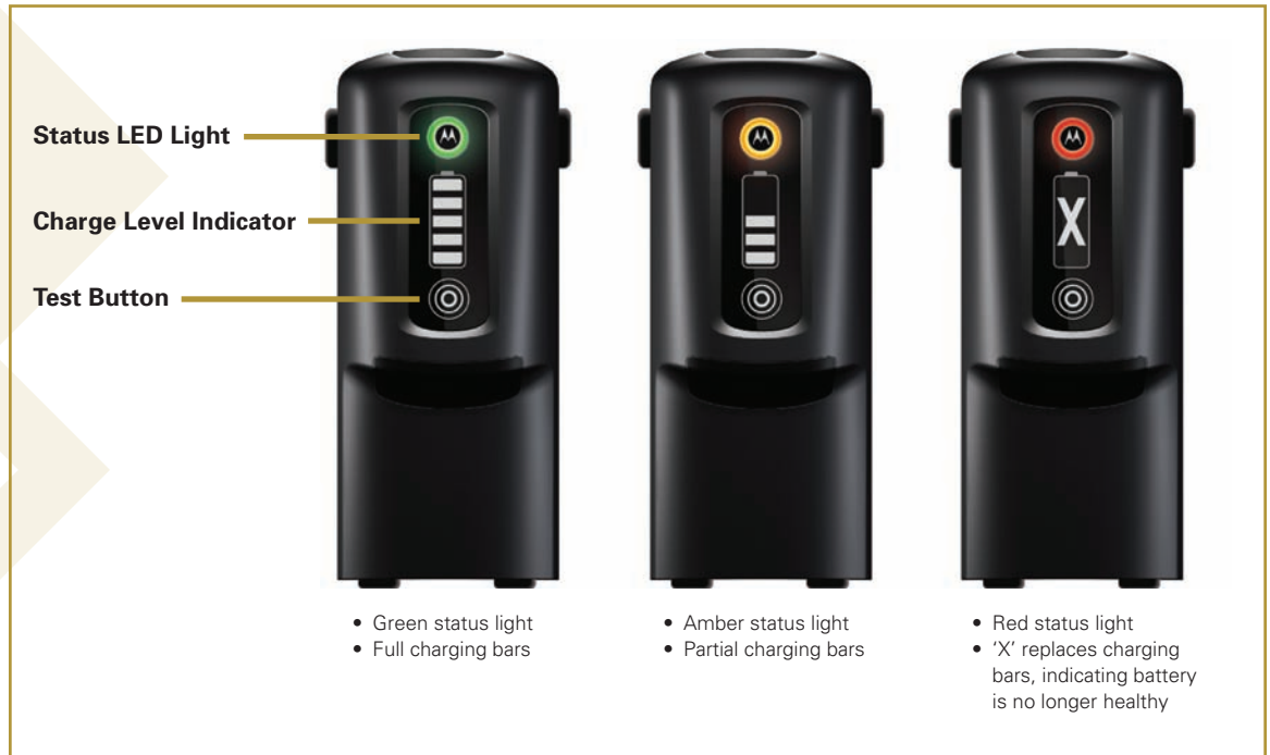
Figure 1: MC9500-K Battery Display — Intelligent Information Indicators

Since the display indicators are integrated directly into the battery, the information is available at all times — regardless of whether the battery is installed in an MC9500-K mobile computer, a battery charger or in a pile of spare batteries in a box. When batteries are in a charger, the display is automatically activated. Whether batteries are installed in the MC9500-K or standalone, a quick press of the status button activates the display. As a result, battery status is always available, removing the guesswork entirely from your battery management practices.